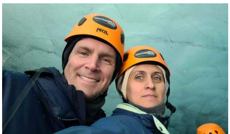
Seljalandsfoss Geysir Ice Cave, Katla