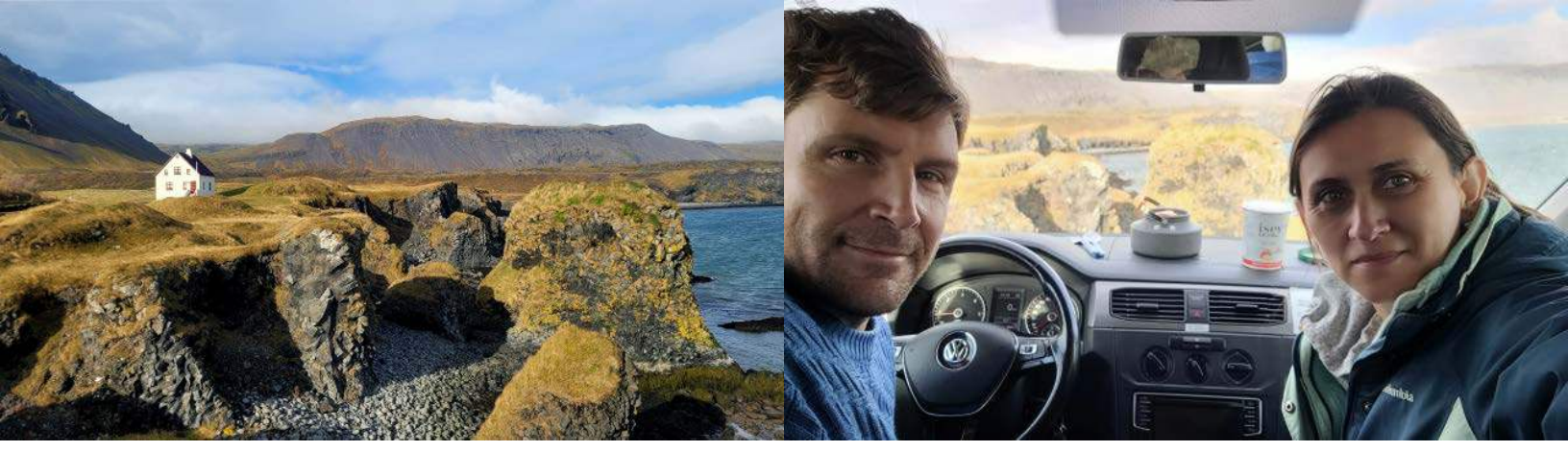
The view from the car, Arnastapi