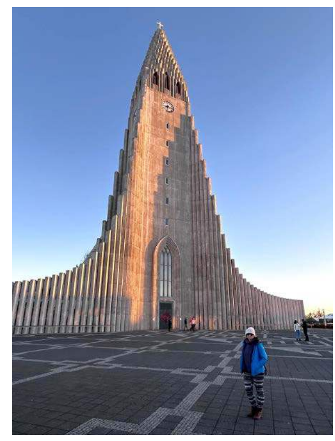
Hallgrímskirkja Church, Reykavik

That first night, we stayed at a campsite right in town, which gave us a chance to get familiar with the van. One of us took charge of putting up the curtains while the other set up the bed and sleeping bags—a little teamwork goes a long way in a campervan! Thankfully, our Caddy came equipped with a Webasto heating system, so we stayed warm and cozy all night long.